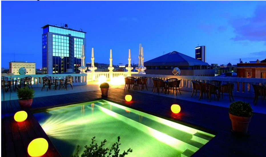
Roof top terrace Casa Fuster

FR9815 Departs El Prat Barcelona 18:40 Arrives 20:10 Stansted.