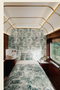
SANCTUARY OF TRANQUILITY