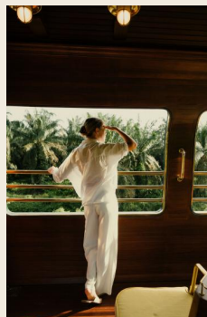
RELAX & UNWIND