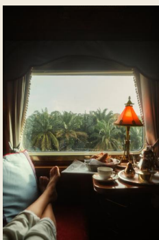
A PLACE TO REST

2 Presidential Suites 20 State Cabins 10 Pullman Cabins