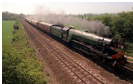
Surrey Hills Evening Tour

Wednesday 1st June to Thursday 2nd June 2016. Dinner on-board the Flying Scotsman